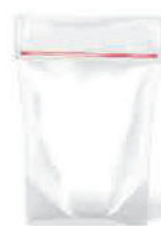
MODIFIED DOYPOUCH FILM WITH STAND-UP POUCH SYSTEM OPTION, (available with or without zipper)