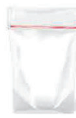
MODIFIED DOY POUCH FILM WITH STAND-UP POUCH SYSTEM OPTION, (available with or without zipper)